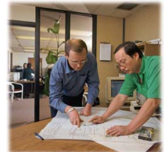
AGI's Internal Sales Co-ordinator and Design Engineer consult on plans for another custom manufactured liquid containment system.

While your custom tanks are being manufactured, AGI can supply you with rental tanks, complete with dispensers, to meet your immediate storage needs and ensure uninterrupted service for your customers - all at a reasonable cost.