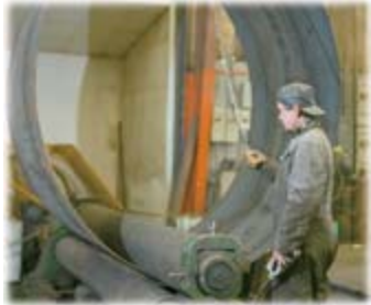
Long, flat sheets of steel are rolled and tack welded into individual tank sections.