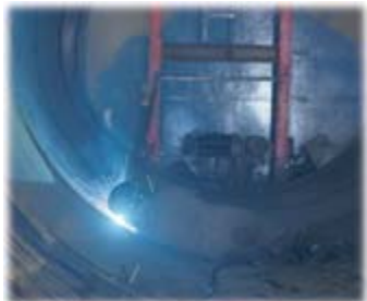
Several rolled sections are seam-welded to make the tank body.