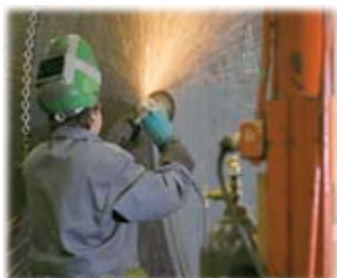
After the main tank has been inserted into the secondary containment, the ends are welded and ground to a smooth finish.