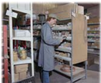
AGI maintains its own in-house parts department to ensure the manufacturing process can proceed smoothly.