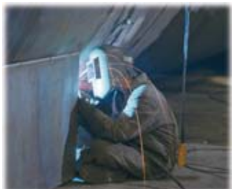
Skids are welded onto a horizontal Envirotank in preparation for sandblasting and painting.